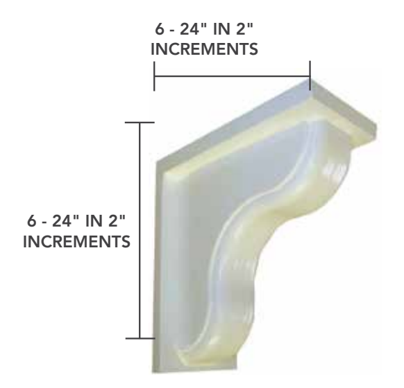
FLUTED FRONT EDGE