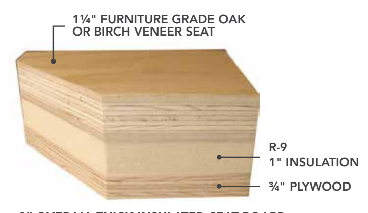
3" OVERALL THICK INSULATED SEAT BOARD